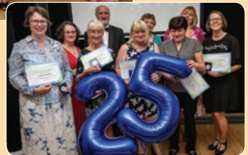
Recipients of this year's Long Service Awards for 25 years of service to the NHS.