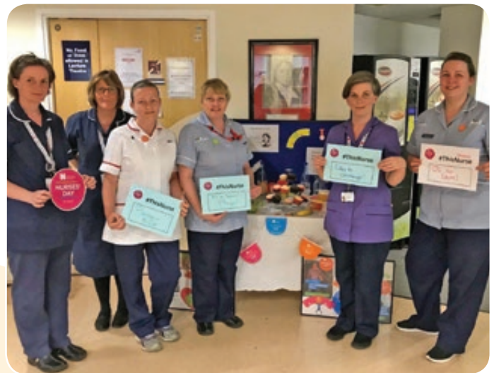
Nursing staff gather in Dorset County Hospital's Education Centre to celebrate Nurses' Day.

"Nurses' Day is a great opportunity to take some time to reflect on what it means to be a nurse today and how it has changed as a profession over the years. Our nursing staff work incredibly hard in a challenging environment and I'm immensely proud of what they achieve in order to provide the very best service possible to our patients."