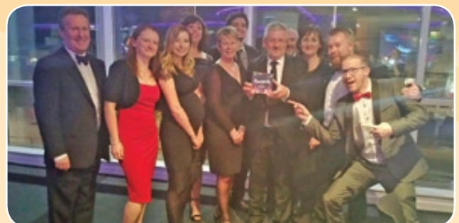
The CORKA research teams from Dorset County Hospital and Dorset HealthCare celebrate their success at the NIHR CRN Wessex awards ceremony.

"The collaboration with Dorset HealthCare has indeed been an 'outstanding achievement' and I hope that it is the beginning of many more fruitful collaborations. Congratulations and thank you to everyone involved."