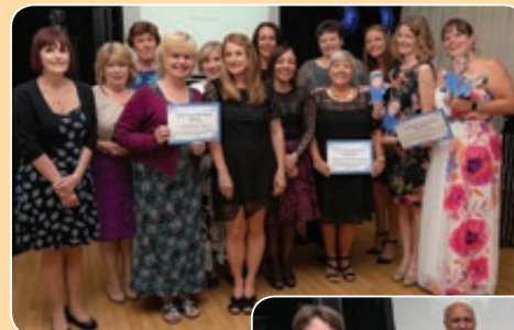
The Discharge Team, winners of the Team of the Year Award, and runners-up the Clinical Site Managers and Critical Care Outreach Team.