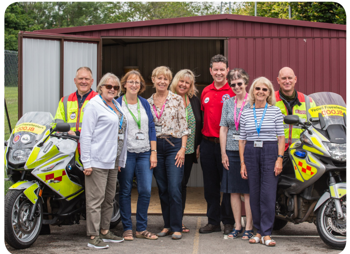
Friends of Dorset County Hospital with the Yeovil Freewheelers outside their new permanent home

"So when we were approached by Blood Bikes and told of their hopes of setting up a garage at Dorset County Hospital we were delighted to be able to help."