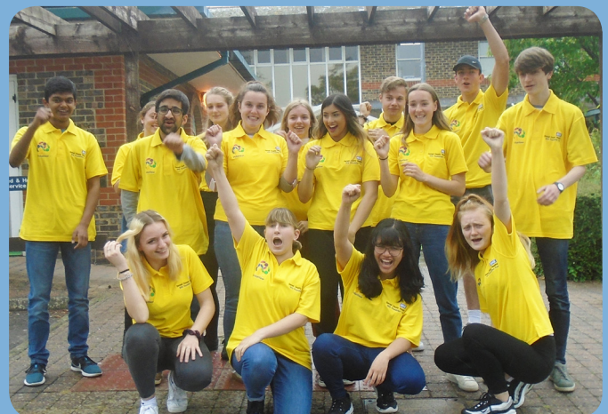
Dorset County Hospital's young volunteers