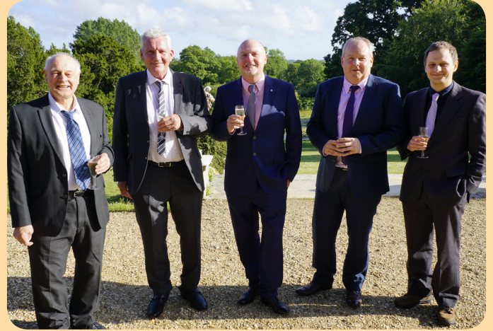
The Estates Team who won the Team of the Year Award

Guests were also treated to a special performance from the DCH Players.