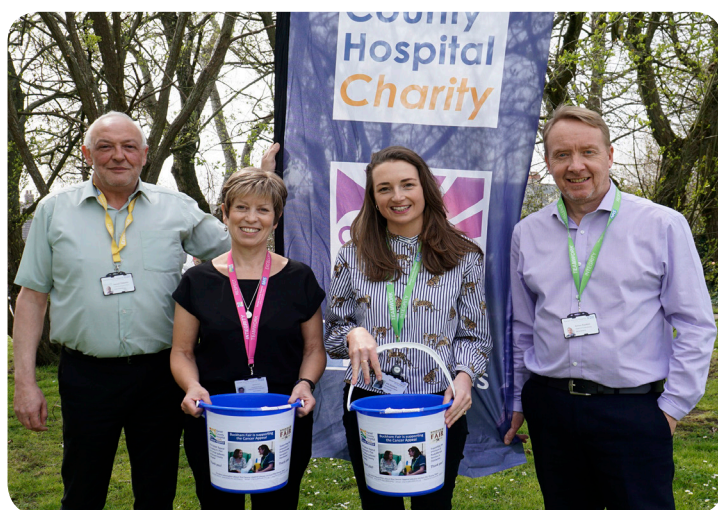
The DCH Charity team

"We want to make sure the refurbishment creates the best possible environment for the future so that everyone can receive their treatment in the way which suits them best. Some people need or wish to be on their own, but there's companionship in the big room where people often make good friends."