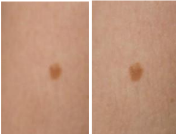
OUT OF FOCUS