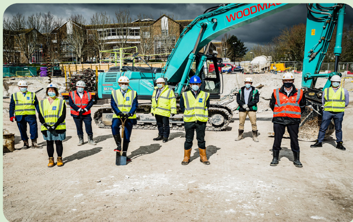
Representatives of Dorset County Hospital, Prime and Willmott Dixon gather to mark the start of construction of the multi-storey car park

For the latest updates about our site development plans, please visit dchft.nhs.uk/about-us/site-development/