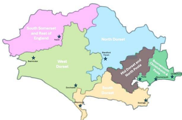
Split of Mid Dorset and North Poole electoral wards